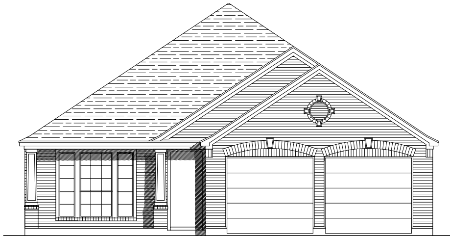
PLAN 1959W E-30