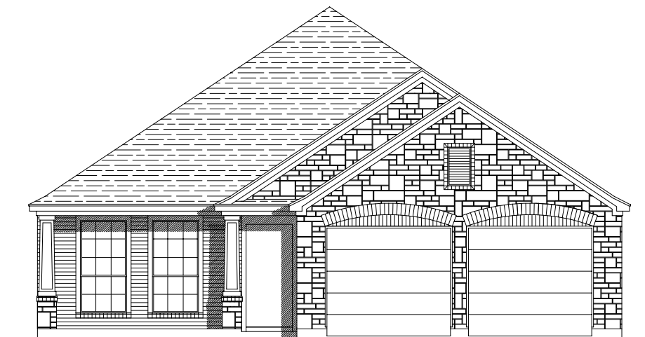
PLAN 1959W E-52