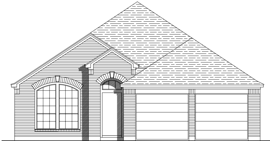
PLAN 1959W E-3