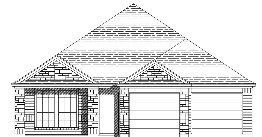
PLAN 1959W E-53

Some of the elevations shown may not be available in all communities.