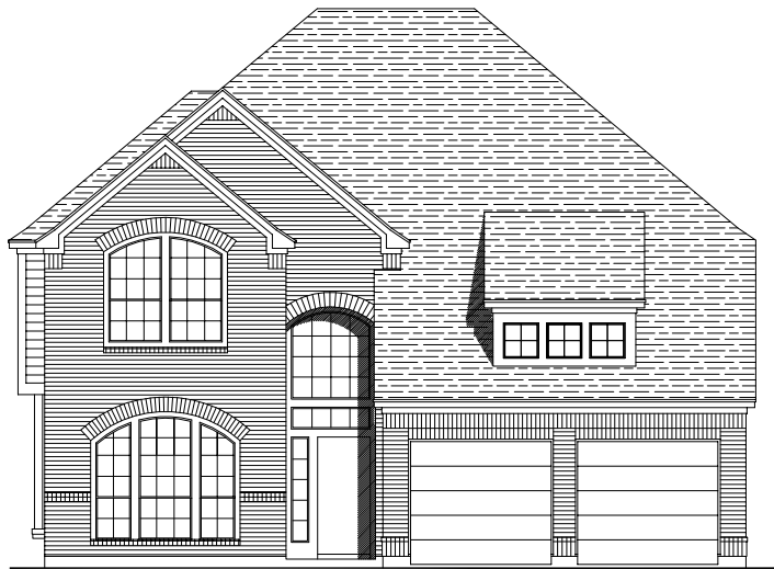
PLAN 2792W E-4