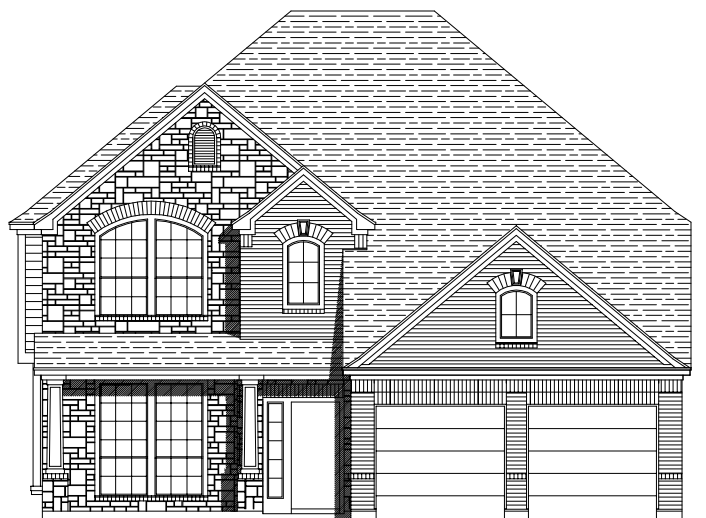
PLAN 2792W E-31

Note: This elevation adds 23 square feet to the floor plan.