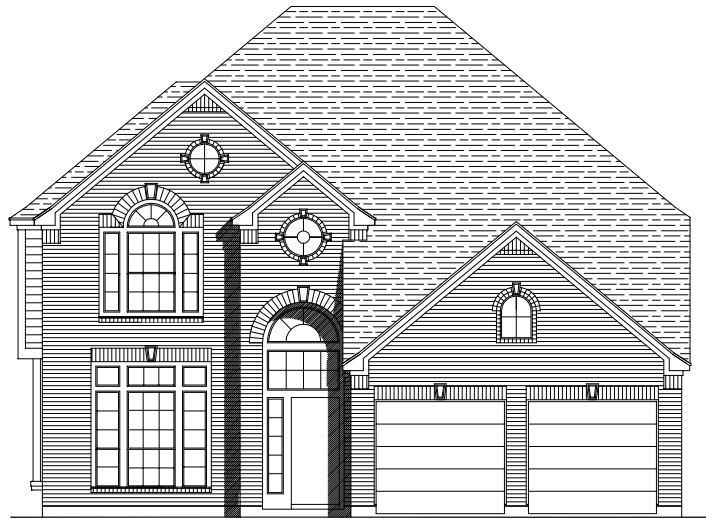
PLAN 2792W E-1

Some of the elevations shown may not be available in all communities.