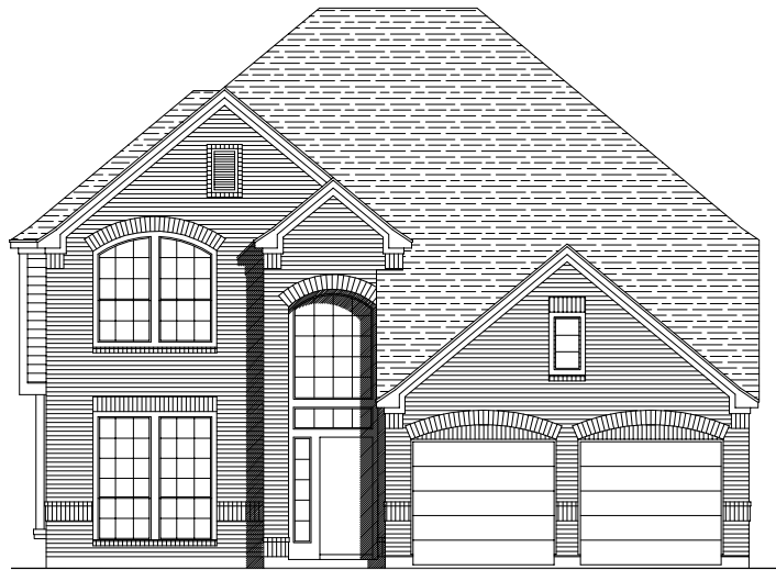
PLAN 2792W E-3