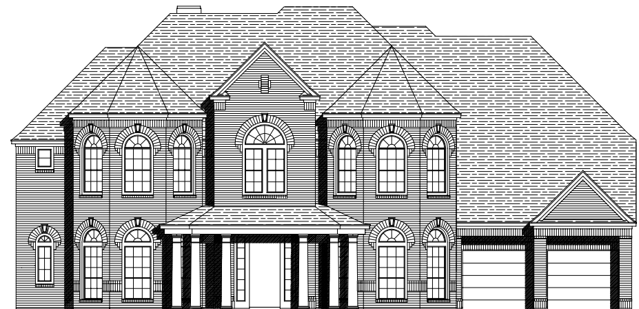
PLAN 5497W E-71

Note: This elevation adds 23 square feet to the floor plan.