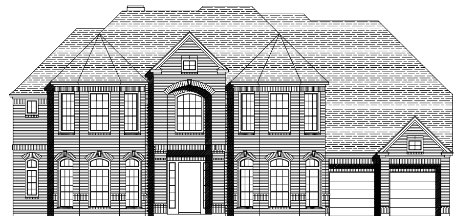
PLAN 5497W E-3

Some of the elevations shown may not be available in all communities.