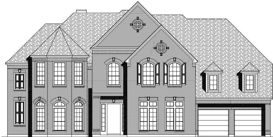
PLAN 5497W E-2