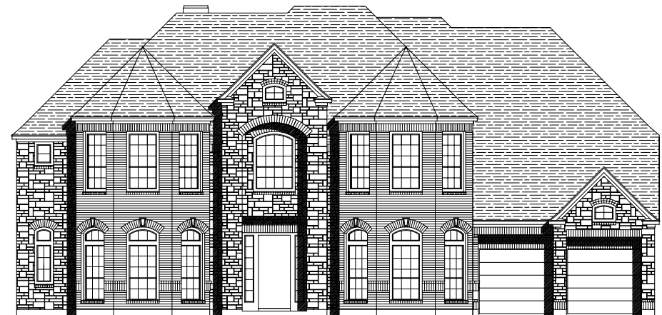
PLAN 5497W E-51