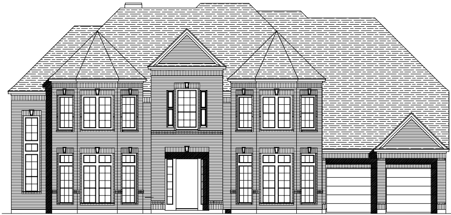
PLAN 5497W E-1

Some of the elevations shown may not be available in all communities.